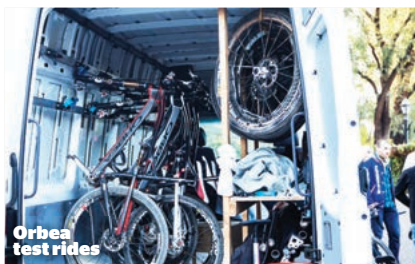
Orbea test rides